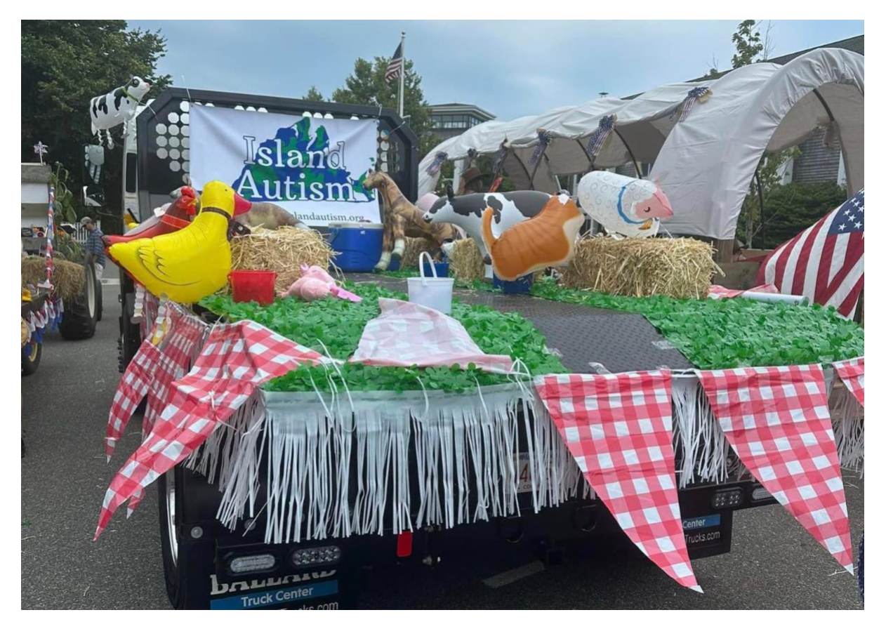
We won "Best Float" in the Edgartown July 4th parade!