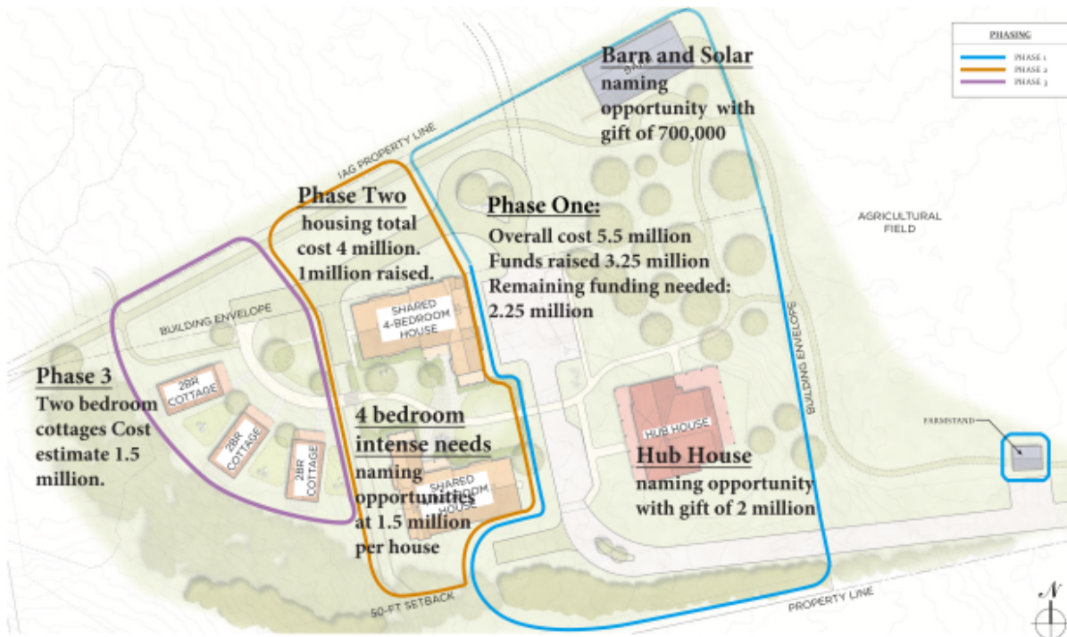
IAG MASTER PLAN AT CHILD FARM OVERALL PROPOSED SITE PLAN - PHASING NOVEMBER 29, 2021 SCALE 1/8" = 1'-0"