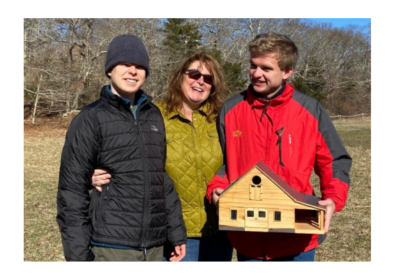
If you see our Barn donation boxes around town, throw a few bucks in for the project please! Help us make our dreams a reality!