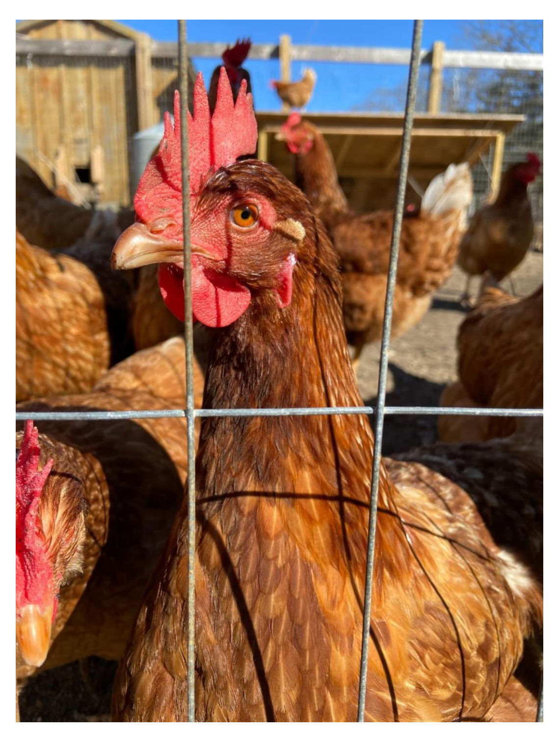
We have 30 more chickens coming in May to join the girls who have laid like champs all through the winter. Eggs from our chickens are currently available at Ghost Island Farm while supplies last!