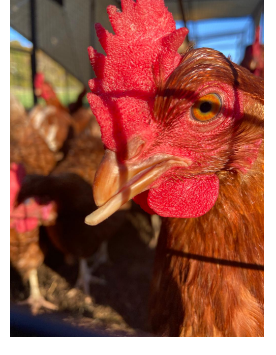
In July the gals moved to 515 Lambert's Cove Road and the chickens happily settled into their new forever home.

This summer we launched our chicken program and our 45 gals started at Katama Farm with the support of the Trustees of the Reservation and the folks at Slough Farm.