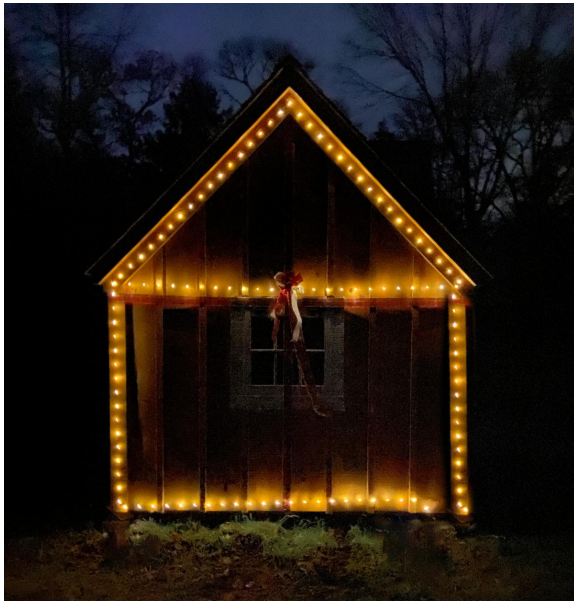
Holiday Lights decorate the Chicken Coop