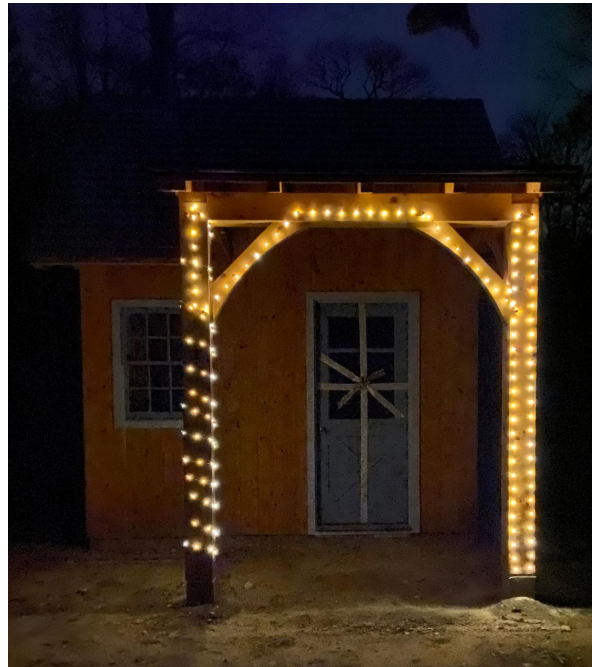
Holiday Lights decorate the Farm Stand